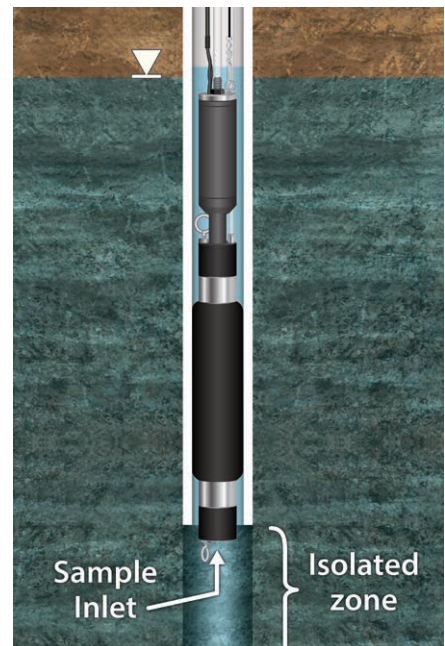
A Model 800M Packer can be used to isolate the sampling zone and reduce purge volumes.

Power Source: A 2.3 m (7.5 ft) power cord uses alligator clips to connect to almost any 12 volt DC power source that can supply at least 45 amps at maximum draw (such as a deep cycle 60 amp AGM battery or higher, or a car, truck or marine battery).