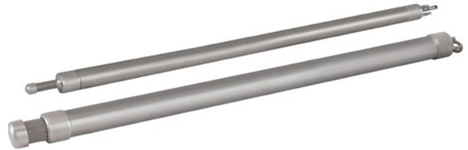
Solinst Bladder Pumps available in Stainless Steel 1" and 1.66" (25 mm and 42 mm).