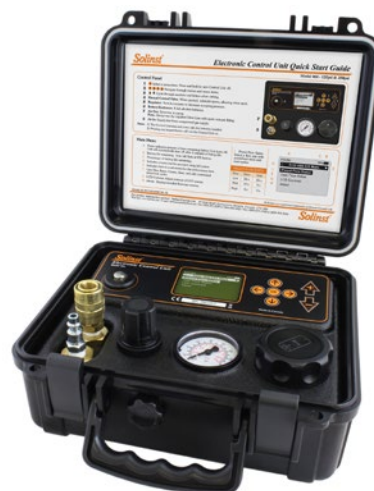
Model 464 Electronic Control Unit (125 psi and 250 psi Models)

These convenient Controllers are rugged, dependable and suitable for all environments. Quick-connect fittings allow instant attachment to dedicated well caps, portable reel units and to an air compressor or compressed gas source.