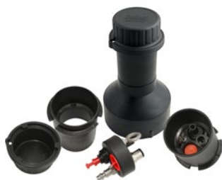
Well Caps for Dedicated Pumps

The caps slip easily onto 2" dia. (50 mm) wells. Adaptors to fit 4" dia. (100 mm) wells are also available. They have quick-connect fittings for the drive and sample tubing.