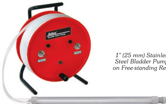
1" (25 mm) Stainless Steel Bladder Pump on Free-standing Reel

They are supplied on a free-standing reel. The rugged systems are very convenient and easy to transport. Tubing fittings on the reels and controller are compression fittings, allowing quick set up in the field. The Solinst Model 103 Tag Line can be used to lower and support the pump in the well (see Model 103 Data Sheet).