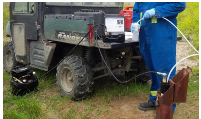
Sampling with a Dedicated Bladder Pump using Portable, Rugged, Easy-to-use, Compressor and Controller

For water level monitoring there is an access hole to fit a Solinst Model 101 Water Level Meter or Levelogger. An eyebolt is provided for a pump support cable or for suspension of a Solinst Levelogger, (see Model 3001 Data Sheet) or other device.