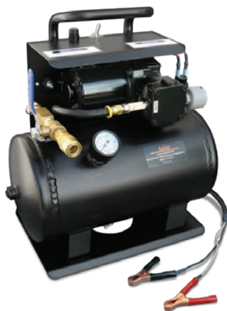
12 Volt Compressor

The compressor operates using 12 volt DC power source, such as a car or truck vehicle battery, and comes with alligator clips. The compressor operates at up to 125 psi and is equipped with a 2 US gallon (7.6 L) air tank which is rated to 150 psi.