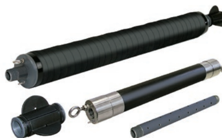
Model 800 Packers 3.9" and 1.8" (99 mm and 46 mm)

Model 800 Low-Pressure Packers can be used with Solinst Bladder Pumps to minimize purge times by reducing purge volumes. This reduces the cost of water disposal and labour. Packers are available in single point or straddle packer designs, and in sizes to fit 2" (50 mm) to 5" (127 mm) dia. wells. (See Model 800 Data Sheet.)